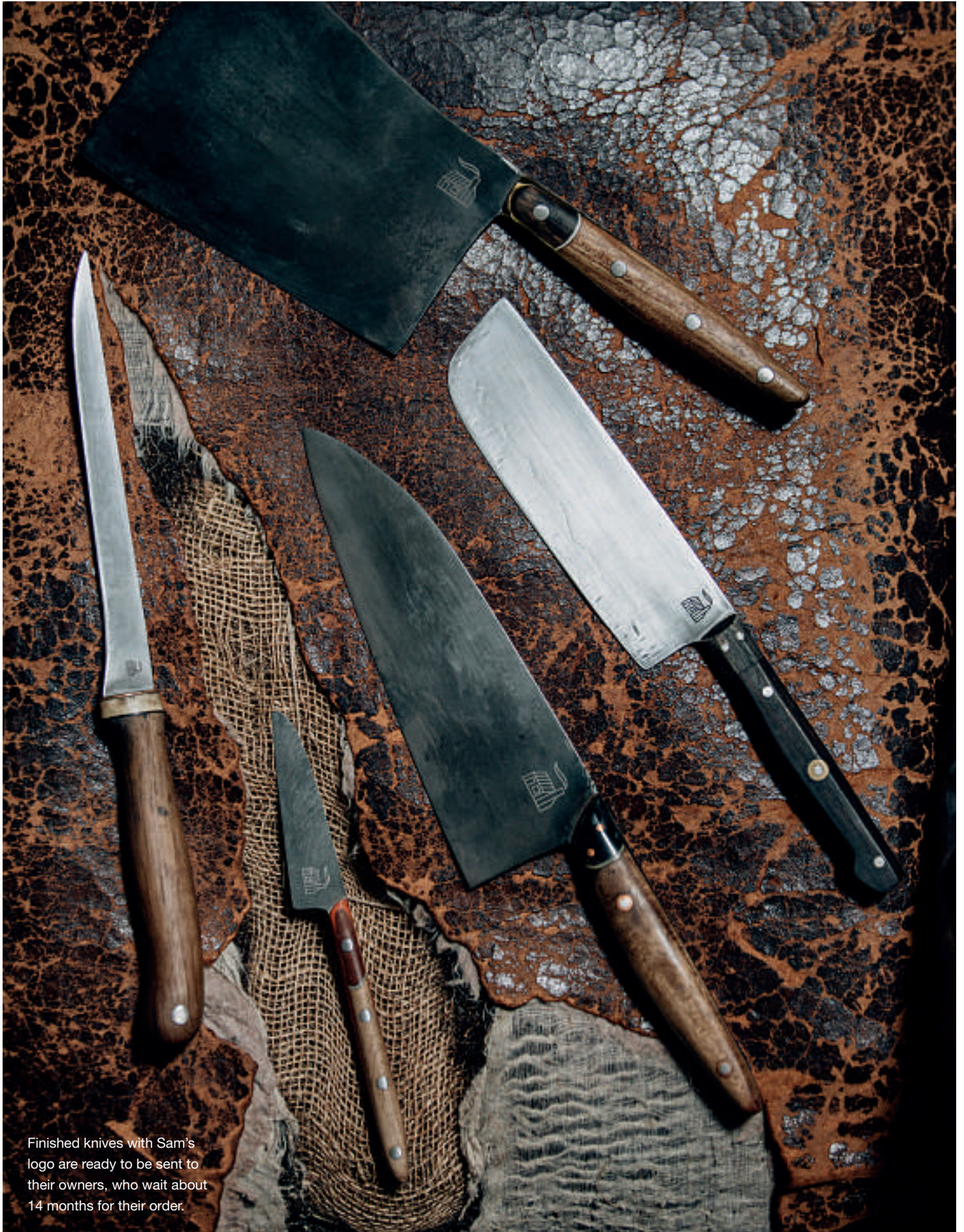
Finished knives with Sam's logo are ready to be sent to their owners, who wait about 14 months for their order.